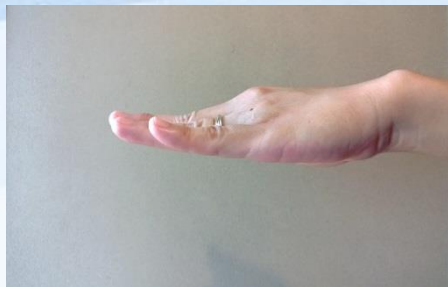
Note B (Mi)