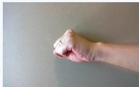
Note G (Do)