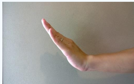
Note A (Re)